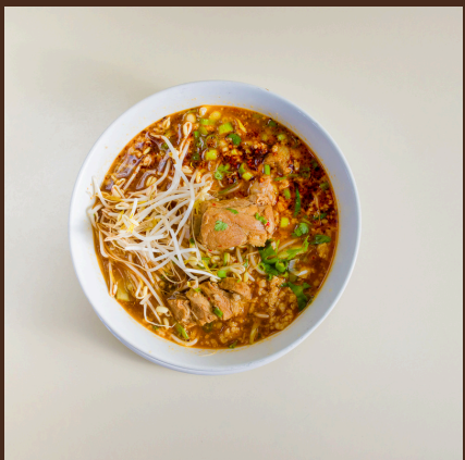
Tom Yum Noodle Soup