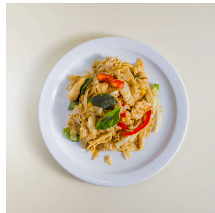
Pad Kee Mao

EGG NOODLES WITH MIXED VEGETABLES IN A GARLIC SAUCE