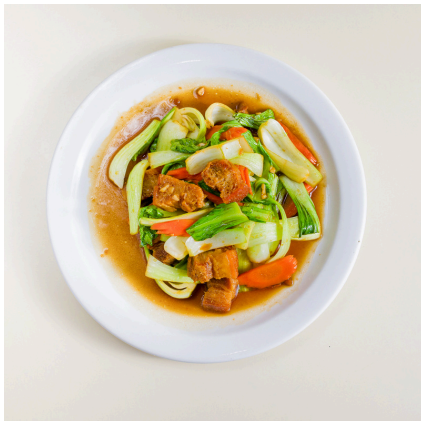
Pork Belly Bok Choy

MEAT OF CHOICE WITH EGGPLANT, BELL PEPPER, ONION, CARROT, AND BASIL LEAF