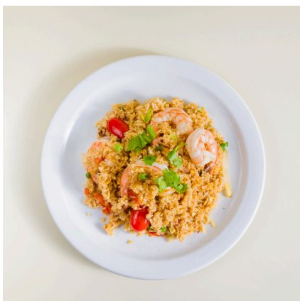
Shrimp Fried Rice

CUCUMBER, TOMATO, BELL PEPPER, CARROT, ONION AND GREEN ONION